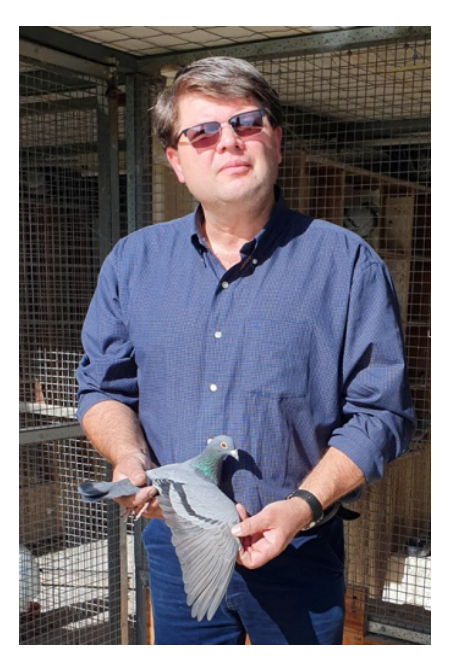
UNIQUE AUCTION SALE OF IMPORTED AND AUSTRALIAN FAMILIES OF SUPERB RACE WINNING PIGEONS

*In case of hold over the Auction will take place, same times, on next Sunday 3<sup>rd</sup> of September 2023