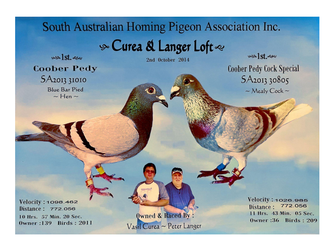
SA-13-30805 MLYC from above picture is full brother of REF. B